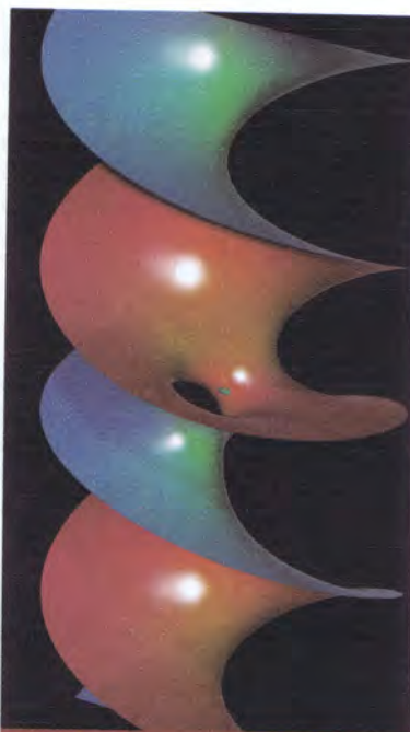
HOLE IN ONE — A tunnel penetrates the central portion of this infinite helicoidal surface, which mathematicians consider a helicoid with a handle.