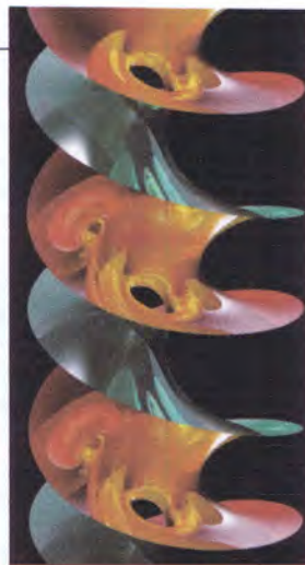
INFINITE TOWER — The central portion of this towering minimal surface features an infinite number of holes, one at each level.

Wolf says, "The times are exciting because we are partly there, but still at the stage where we don't know if we are nearly there or only a few steps down the path." ■