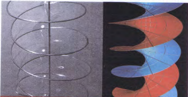
SLIPPERY SLOPE — A spiral slide, as in this photo of a soap film, makes up the central core of half of an infinite minimal surface called a helicoid. The computer-generated image (right) shows a central portion of a helicoid. The distinct red and blue surfaces demonstrate that this is a double spiral. The sheets extend laterally to infinity.

That wasn't the only surprise. The team had actually identified an infinite family of minimal surfaces, each characterized by a dif-